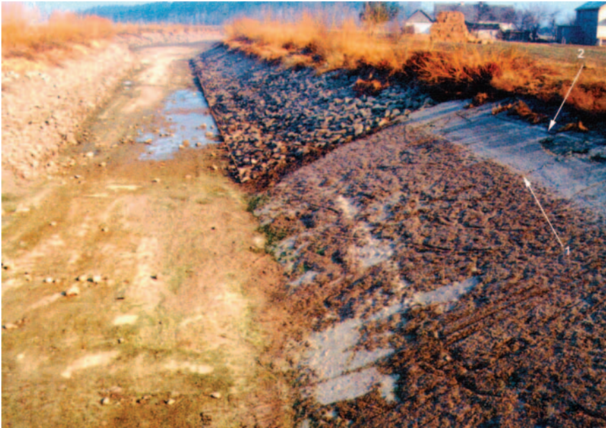
Photo. 1. D. polymorpha assemblages on rock reinforcements in Piotrkowicki Canal beyond the Piotrkowice pumping station (Fig.1) in March 1996. 1 – boundary of larval settlement after the canal became part of the water circulation system in May 2005. 2 – water level in the canal during the summer 2005 period.

The mussels that attempted to colonize the warmest zone of the ecosystem had a lesser chance of success. Here they died in mass numbers during periods with increased water temperature (> 28°C) and as a result of increasing silting of the substrates. The mussel cohorts that settled lotic habitats rich in substrates that were moderately heated with substantial water turbulence and flow, which ensured continuous food delivery, had a greater chance of survival. In the opinion of many researchers (Stańczykowska 1977, 1997, Gist et al. 1997, Marvin and Howell 1997, Lewandowski 2001), this set of trophic conditions can be as important as water temperature in the settlement of mussels in certain locations. Conditions such as these in the Konin system were provided by some canals: including the one that delivers water to the Konin Power Plant (station 1) and the one that links Lake Licheńskie with Lake Pątnowskie (station 2). These habitats are the key zones