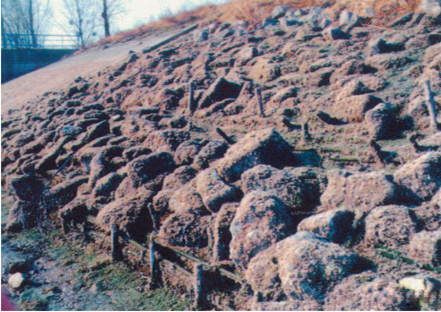
Photo. 2. D. polymorpha assemblages on the rock reinforcement in Piotrkowicki Canal.

supporting the occurrence of the zebra mussel throughout the ecosystem. Similar habitats are provided by the Piotrkowicki Canal (after the pump station above station 4); however, this canal only carries Lake Licheńskie water to Lake Ślesińskie in the vegetation season from May to September. Mussels that settled in spring on the sides of this canal usually died after it was drained in the fall-winter period (Photo. 1 and 2).