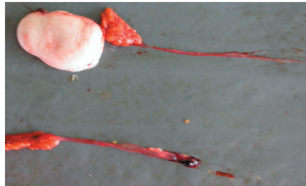
Photo 2. Gonads of bisexual rainbow trout with well-developed left testicles (upper) and immature oocytes. Right testicle is undeveloped (lower).

In research on sex reversal in rainbow trout, Demska-Zakęś et al. (1999) used 20 ppm OHA in a starter diet and obtained 100% males, while with 5 ppm MT, they obtained 70% males and 30% bisexual individuals. Since this experiment was based on a two-sex population consisting of 50% males and 50% females (in the control group), it can be concluded that after female masculinization, the authors obtained 100% neo-males in the OHA group, and about 40% neo-males plus about 60% bisexual individuals from the MT group. In this study, the sex