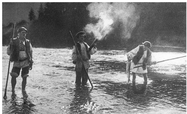
Figure 2. Huchen fishing on a postcard from Kosów in the Prut River drainage area.

From the faunistic point of view the most important information concerns the historical occurrence