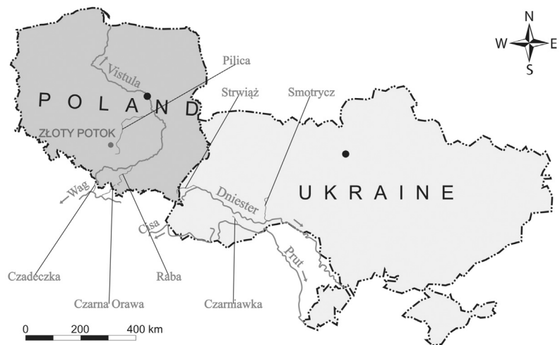
Figure 1. Waters mentioned in the context of huchen in historical Polish sources.

The average huchen price was 5.21 gr. (496 gr. ÷ 76 fish), and that for trout was 0.30 gr. (188 gr. ÷ 620 fish). Therefore, the average huchen was 17 times more expensive than the average trout. Assuming that most of the trout were approximately