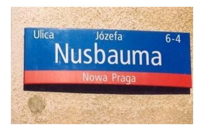
Figure 1. A street in Warsaw (Poland) is named after the famous Darwinist and comparative anatomist Józef Nusbaum (1859–1917) from the University of Lwów (today Ukraine).

<sup>a</sup> The first publication is regarded as the career starting point in fish immunology; <sup>b</sup> M. Michael Sigel (1920–1995) emigrated from Poland to the USA in 1937. For additional information on M.M. Sigel see Van Muiswinkel [2].