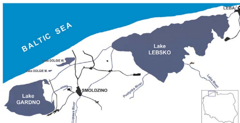
Fig. 1. Area of studies. Location of Lake Dołgie Wielkie.

Lake Dołgie Wielkie is directly adjacent to the Baltic Sea and is located between the Gardno and Łebsko lakes in the Słowiński National Park (Fig. 1). It was created