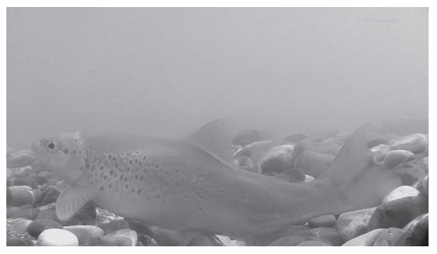
Figure 1. Female softmouth trout probing substrate with her anal fin.

One female was recorded continuously abandoning her nest. She stayed for short periods of time during which she performed a total of 32 digging